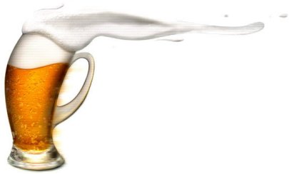
Schmohz Root Beer

Schmohz, home of Hopknocker, Bonecrusher, Amber Tease, and Treasure Chest, proudly presents to the increasing number of runners, beer drinking runners that is, our racing brew Achilles Ale, providing a lighter easy drinking ale. Refreshing and exhilarating during and after the race, Enjoy an Achilles!